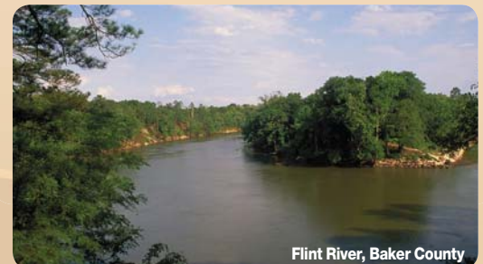
Flint River, Baker County